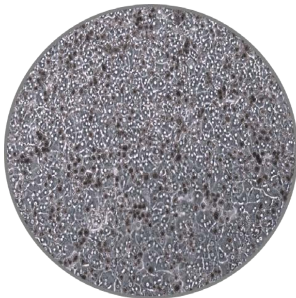
HUM4055A, 24Well with Overlay, 72Hrs, 10X