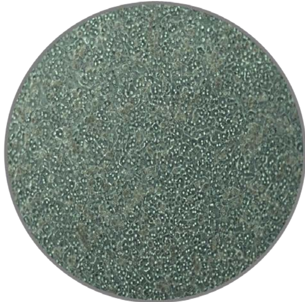
HUM4094, 72hrs 10X