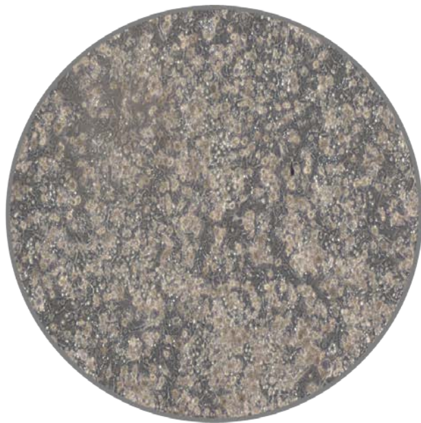
HUM4108, 96hrs, 10X