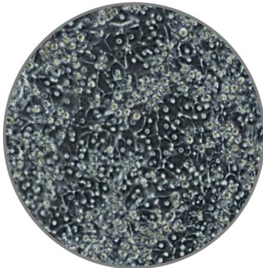
HUM4129, 72hrs, 10X

Characterization was completed in a 24-well collagen-coated plate with extra-cellular matrix overlay