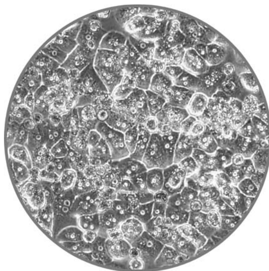
HUM4217, 24hrs, 10X

Characterization was completed in a 24-well collagen-coated plate with extra-cellular matrix overlay