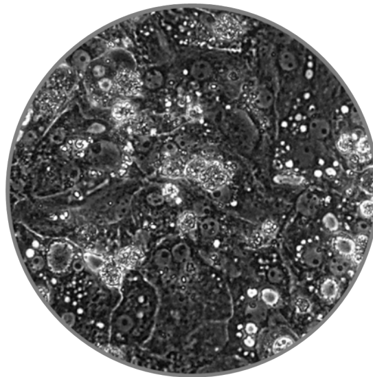
HUM4221A, 96hrs, 20X